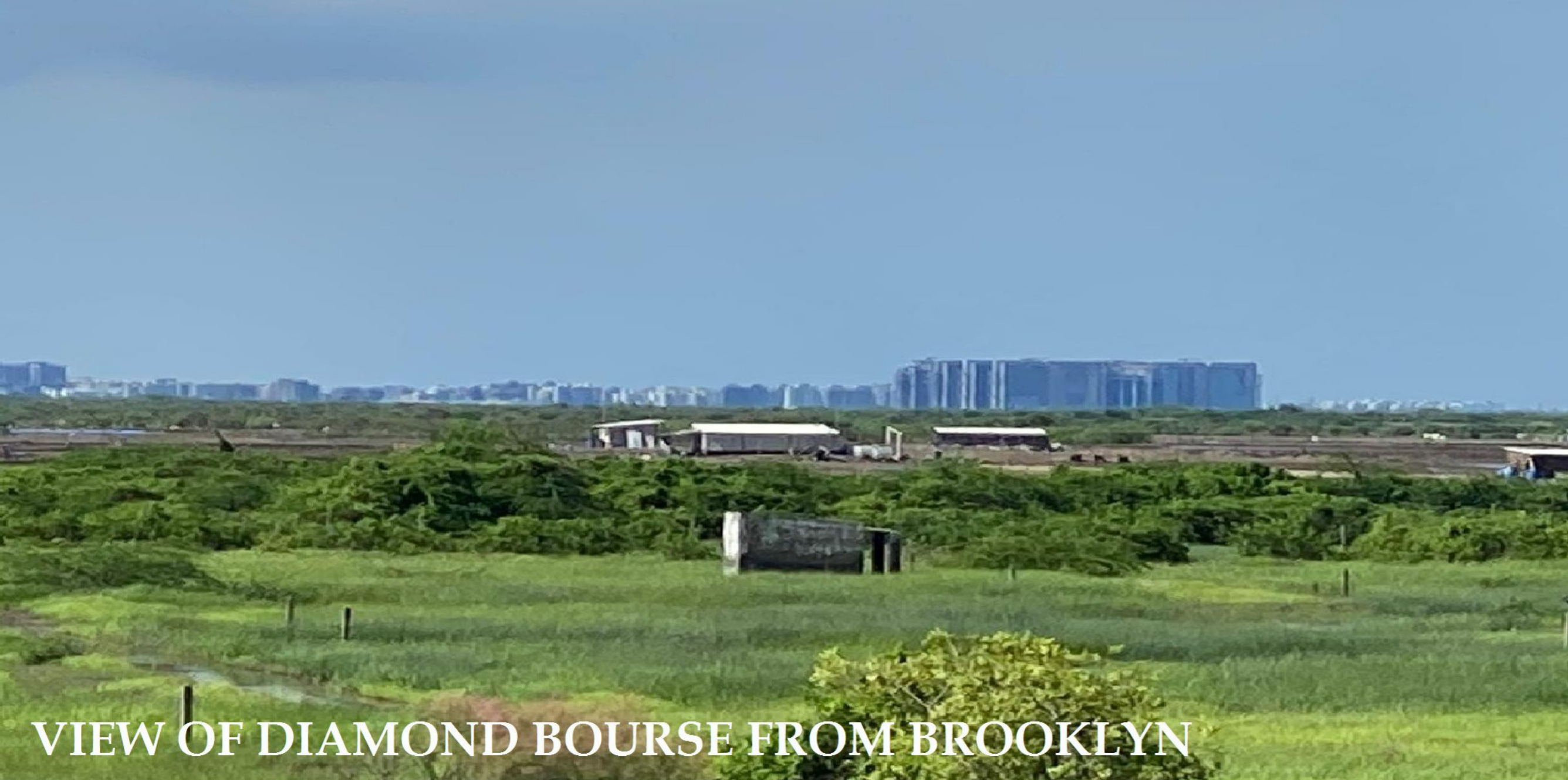
VIEW OF DIAMOND BOURSE FROM BROOKLYN